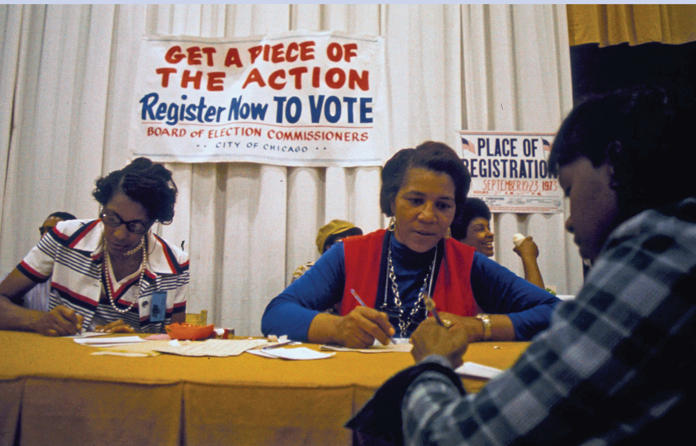
Voter Registration Drive, October 1973