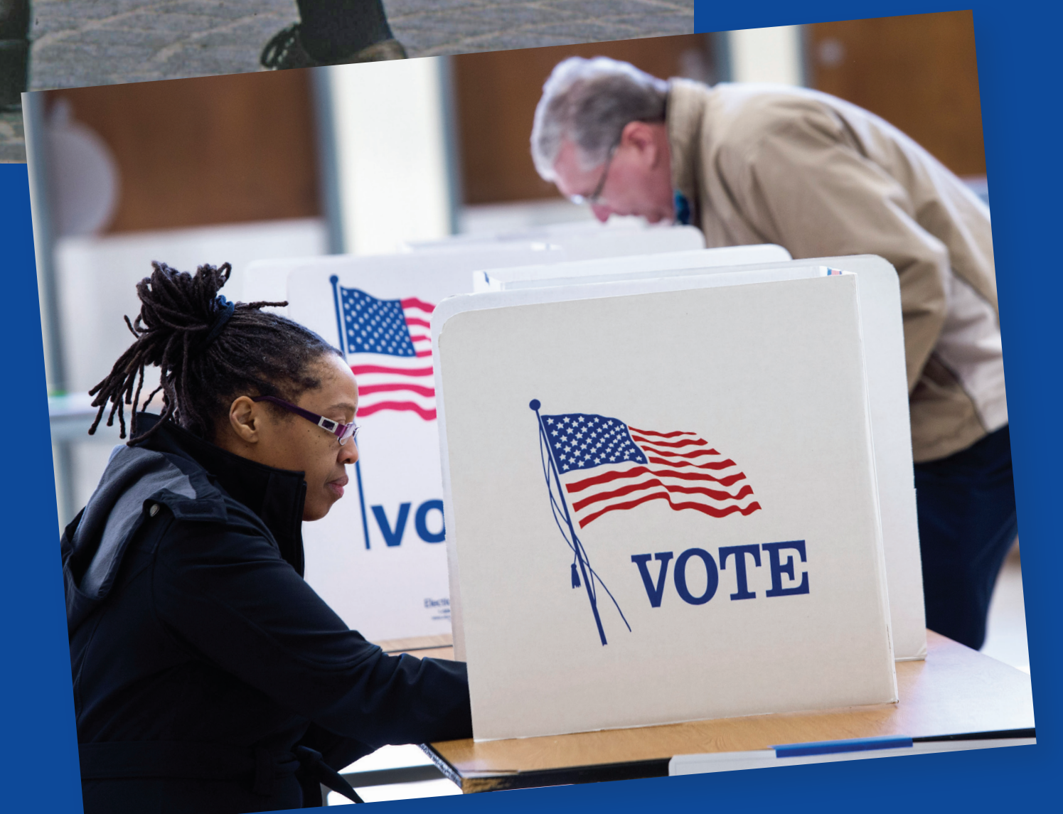
People vote in the Virginia primary at Centreville High School in Centreville, Virginia, March 1, 2016