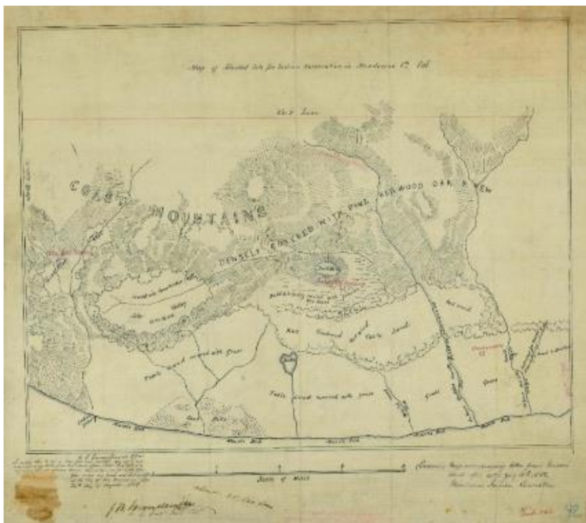
Map of Selected Site for Indian Reservation in Mendocino County, California, 7/30/1856.