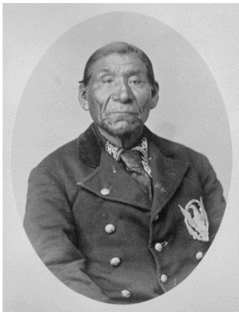
Winnemucca (The Giver), a Paiute chief of western Nevada, 1880.