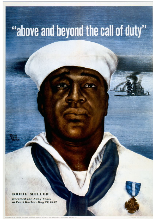
"Above and beyond the call of duty" National Archives Identifier 513747

At 7:48 am on December 7, 1941, Japanese fighter planes and bombers began their surprise attack on the U.S. Naval base at Pearl Harbor in Hawaii. In two waves of attack, the Japanese sunk four battleships and destroyed 188 aircraft. The attack also damaged four other battleships, three cruisers, three destroyers, an anti-aircraft training ship, and one minelayer. The early morning attack killed 2,403 Americans and injured another 1,178. The attack on Pearl Harbor by the Japanese caused the United States to enter World War II.