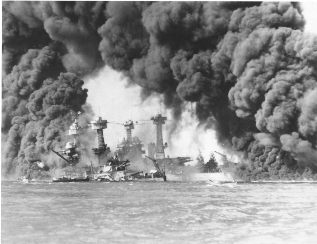
Photograph of the USS West Virginia and the USS Tennessee after the Japanese Attack on Pearl Harbor, 12/7/1941

In Record Group 80 Correspondence Relating to Discrimination, 1941-1944 ( National Archives Identifier 120920855 ) series, the file unit Dorie Miller ( National Archives Identifier 26416709 ) contains memorandums, letters, and newspaper coupons from the black community to President Franklin D. Roosevelt, encouraging him to admit Miller to the Naval Academy. As a messman, Miller was ineligible for military training, even though he was a hero in the Pearl Harbor attack. The letters and coupons from black newspapers to Roosevelt received attention from the president and were forwarded to the Navy Department. However, Miller was too old to attend the Naval Academy. Only candidates for midshipmen between the ages of 17 and 21 were considered. Miller was 23-years-old.