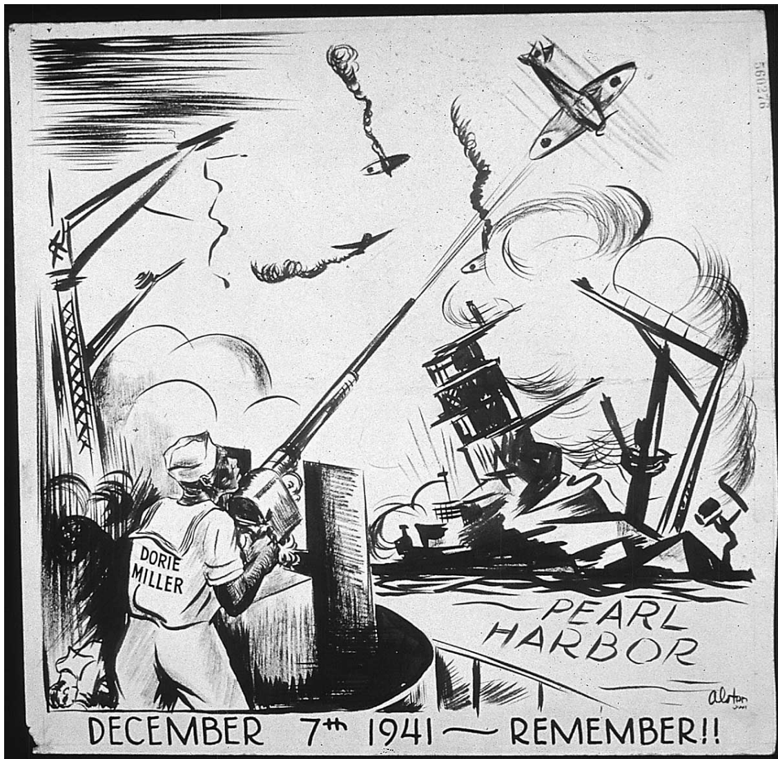
"DECEMBER 7th - REMEMBER!!", 1943, National Archives Identifier 535613

Navy Messman Third Class Dorie Miller, was born on October 12, 1919 in Waco, Texas. Miller joined the U.S. Navy in 1939, and was made a mess attendant, then cook, aboard the USS West Virginia. During the Pearl Harbor attack, Miller first ensured the safety of several crewmates, before he began firing at Japanese warplanes with a 50 caliber anti-aircraft gun. Miller shot down two Japanese aircraft (possibly downed two more) during the raid.